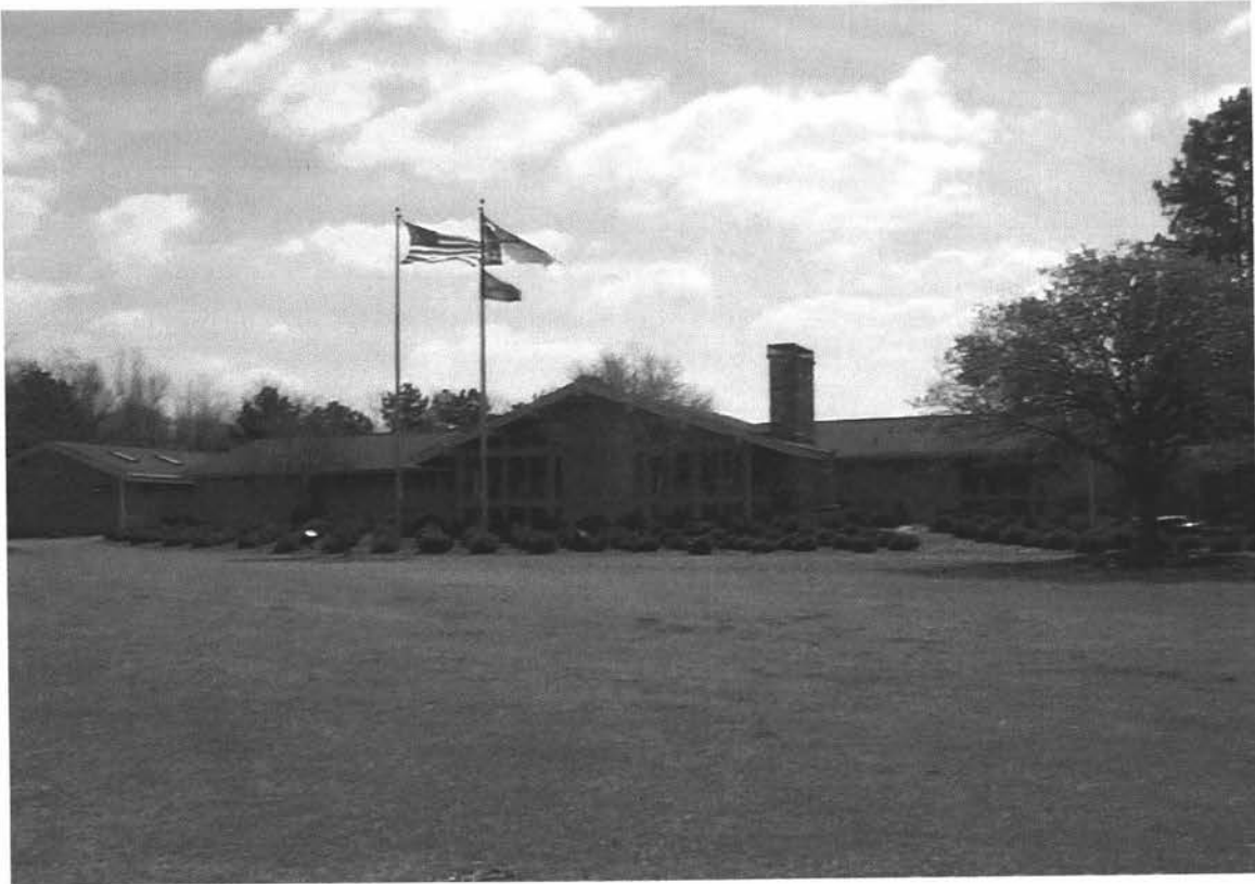
WELCOME CENTER FA# 78-25-09