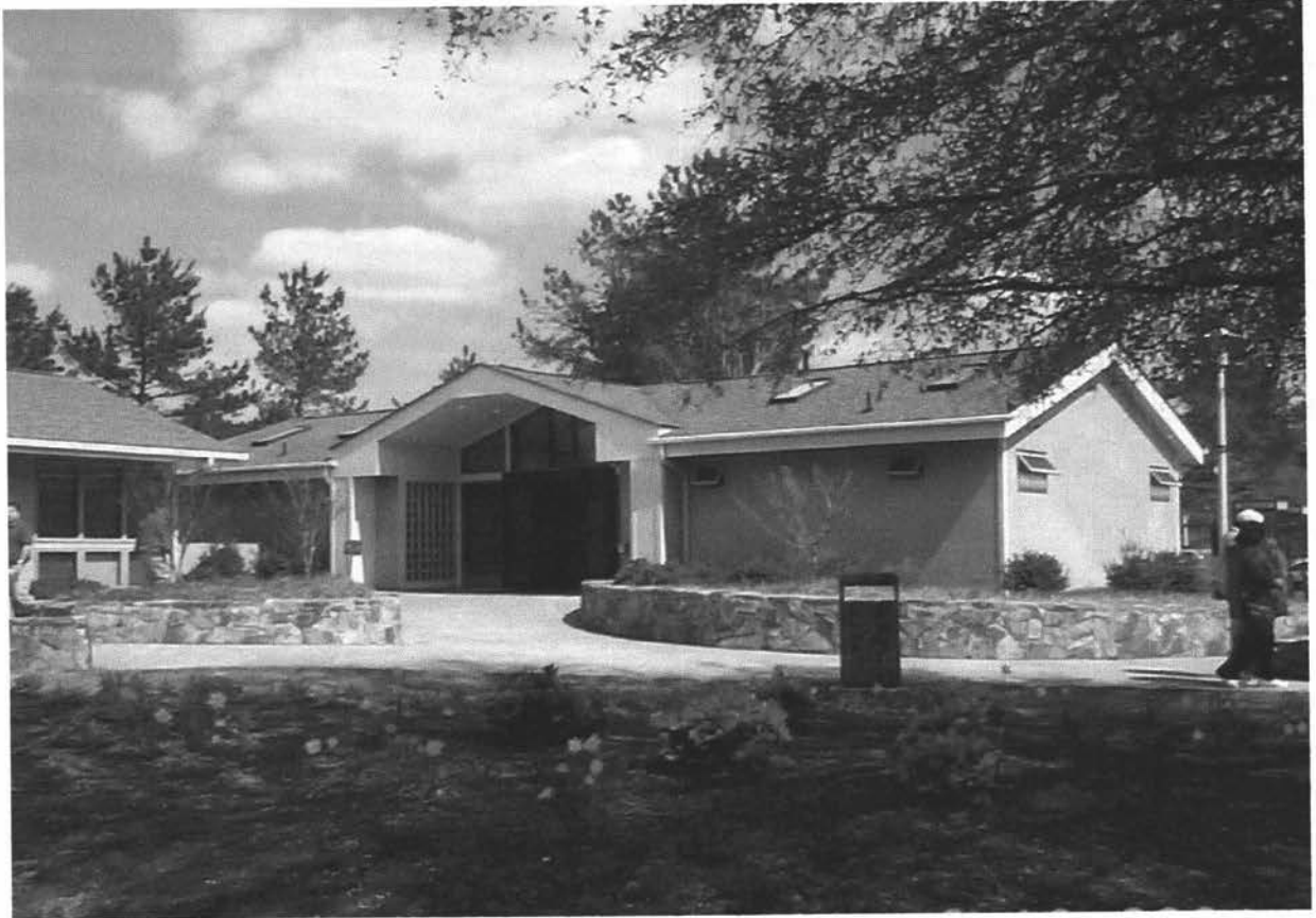
WELCOME CENTER RESTROOM BUILDING FA# 78-25-10