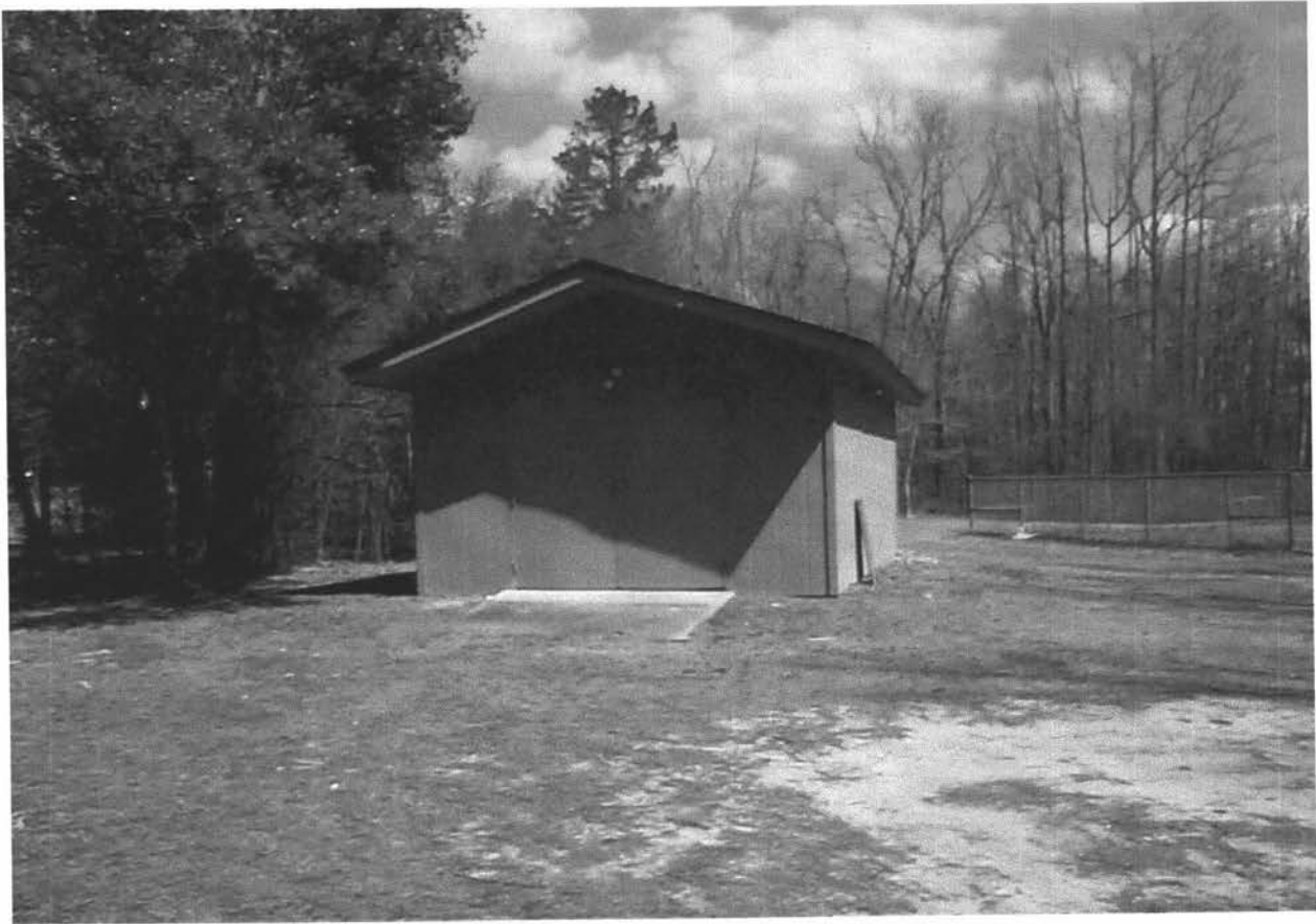
REST AREA STORAGE BUILDING FA# 78-25-12