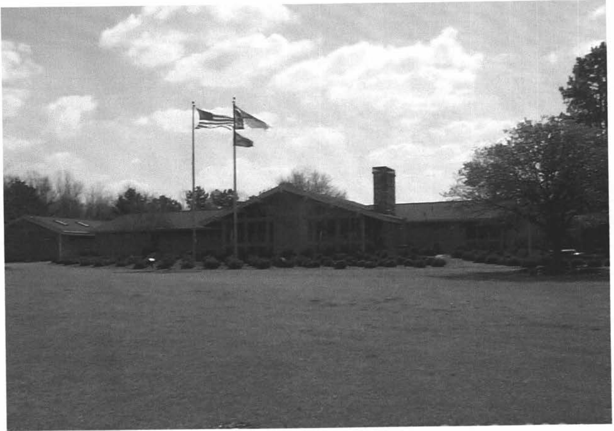
WELCOME CENTER FA# 78-25-09